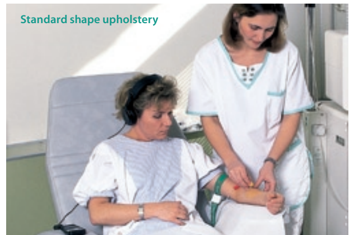
Standard shape upholstery

* More than 30 colours are available upon request