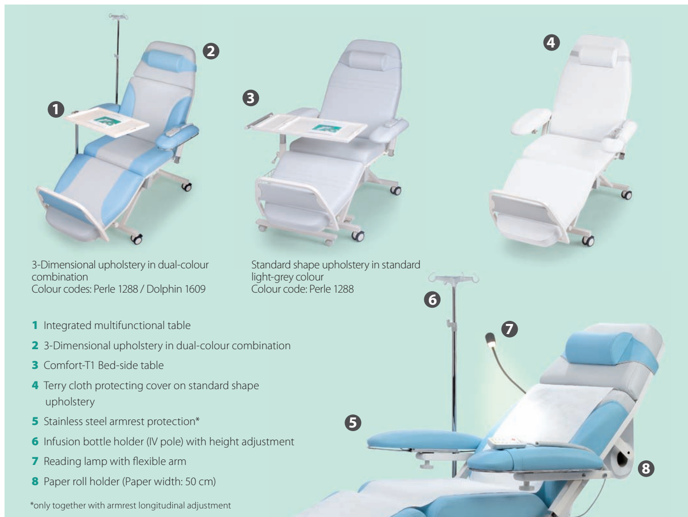
3-Dimensional upholstery in dual-colour combination Colour codes: Perle 1288 / Dolphin 1609